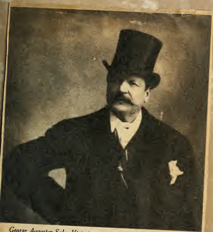
George Augustus Sala, Victorian journalist, thought of the Savage Club.